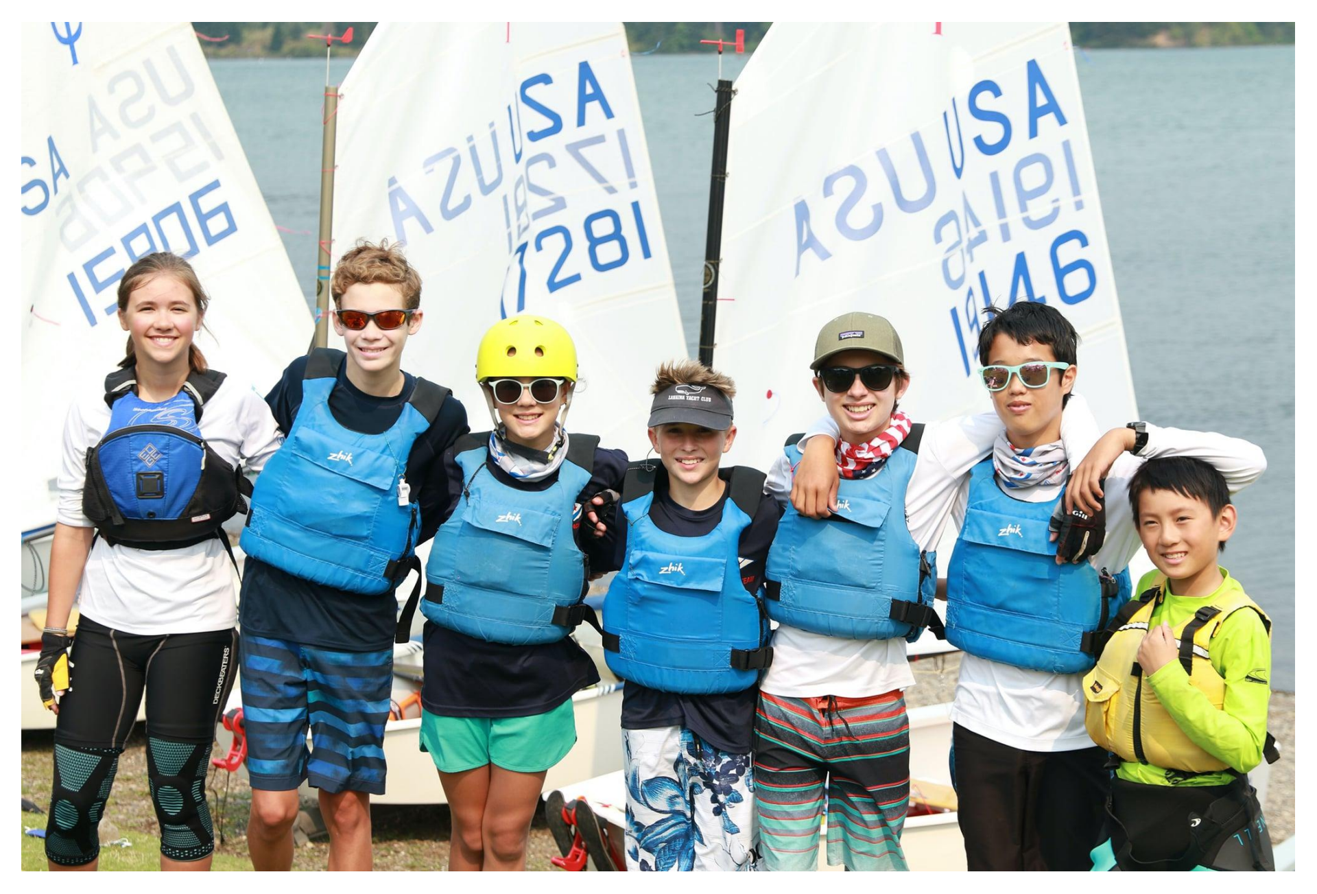
THANK YOU PORT OF CASCADE LOCKS FOR ALL YOUR SUPPORT!