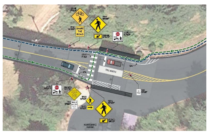
Proposed Safety Enhancements around the toll booth to provide better access for pedestrians.