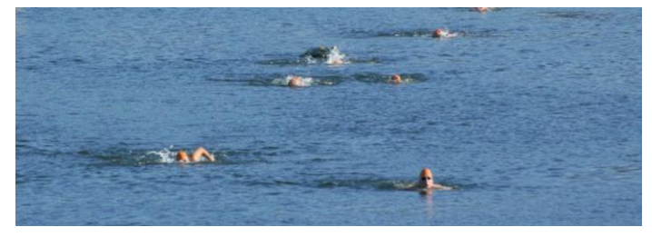
Participants in the Cross Channel Swim