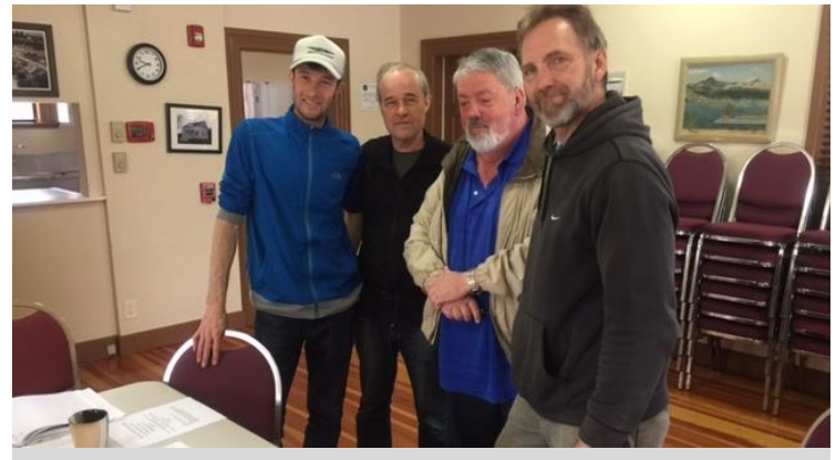
Ravenwood presenting plans for the Parkview property to Economic Development Sub-Committee.

transportation projects to aid local economic development efforts.