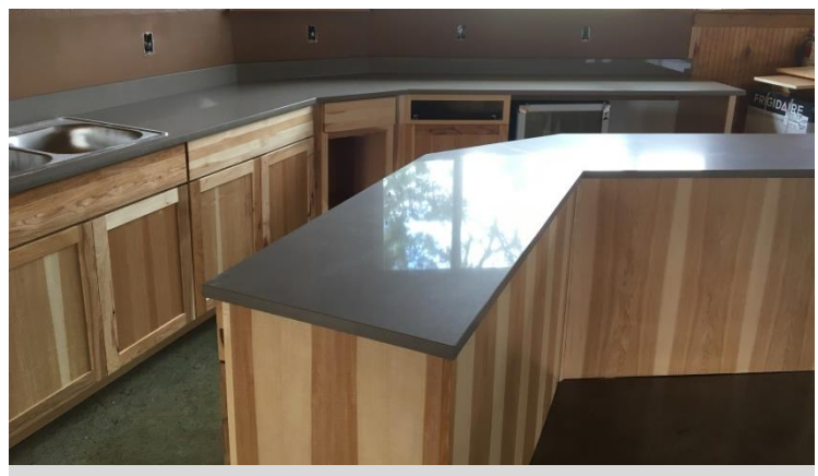
Pavilion's new service counter with sink and under-cabinet refrigeration completed as part of the 1<sup>st</sup> year of the Adopted Pavilion Enhancement Program.