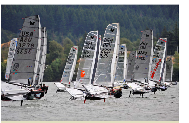
Moth racers in Cascade Locks